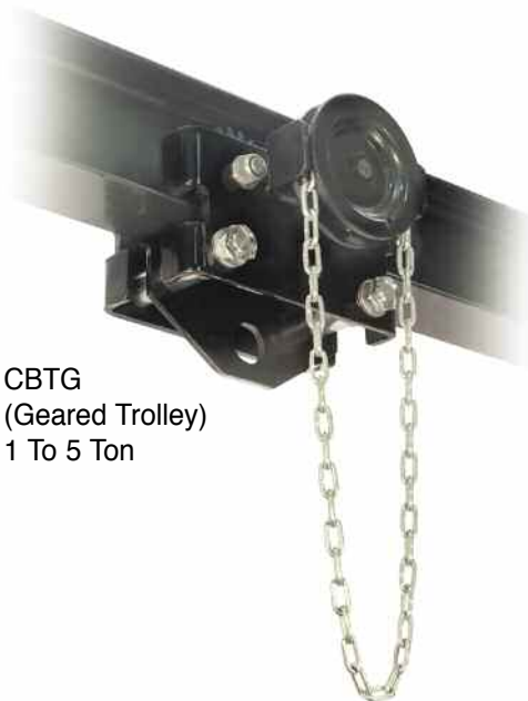
CBTG (Geared Trolley) 1 To 5 Ton