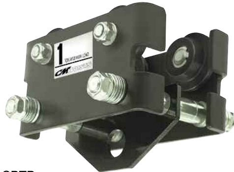
CBTP (Plain Trolley) 1/4 To 5 Ton